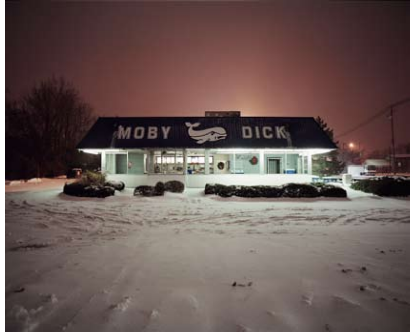
1500 Mellwood Ave.

There's something a little subversive about trying to preserve images of a landscape that is meant to be disposable. These are places that are here for us, but they are not by us. Furthermore the occurrence of corporate espionage has made it