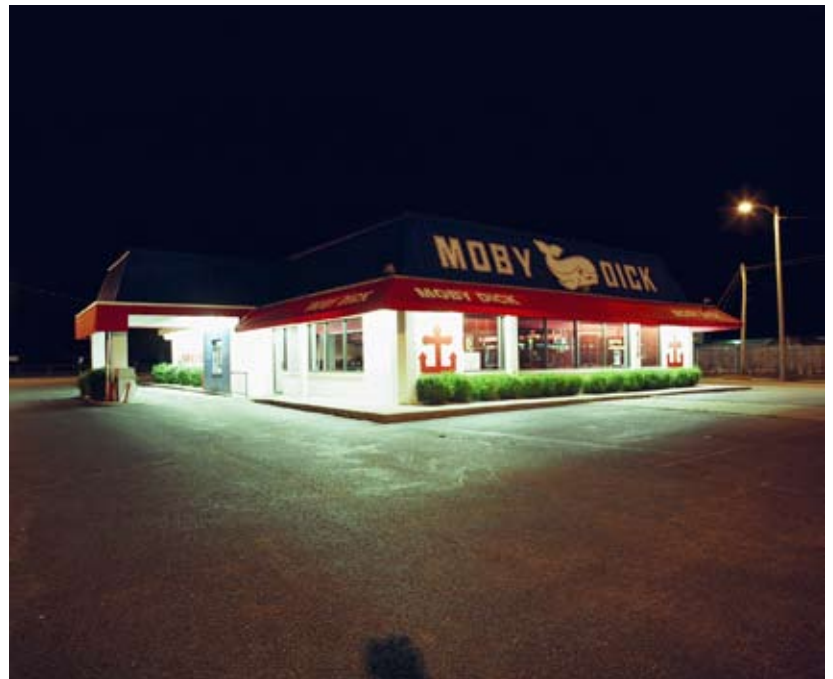
8219 Preston Hwy.

Of course, for a land locked place like Kentucky, anything having to do with the ocean has a built in appeal. This explains Jimmy Buffet and the tiki-torches we put in our backyards come summertime. But it's not really the ocean people want; it's the edge of the ocean. They want to see the point where earth, air and water meet, where life's possibility finds its greatest physical expression. As Melville and Coleridge have expressed, the ocean itself is a dessert. In order for the mariner to continue, she needs to possess a certain faith that there is something out there in the ocean's indistinguishable vastness or that land will eventually appear on the horizon. Forgive me if I wax poetic for a moment here and say that if the camel is the ship of the dessert than Moby Dick is the camel of the blacktop. On the edge of town, awash in darkness, Sarah and I stood under the great whale and contemplated the possibilities for two castaways such as us. Could we get away with creating something new out of these empty forms in overlooked places? Nobody seemed to be paying attention.